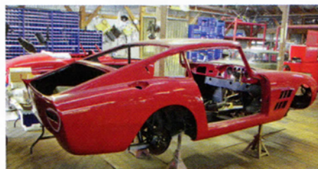
Stripped to bare metal for body repair is a 1960 Ferrari 250 Series II PF cabriolet, while a custom-bodied 1964 Maserati 3500GT's restoration nears completion.