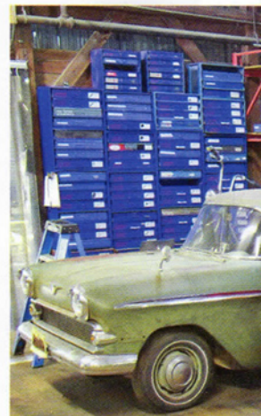
A 1948 Healey Westland receives final adjustments before leaving. Sunbeam Alpine and rare Vauxhall station wagon prove Jason's interesting taste in cars.

equipment needed for such painstaking construction. There's a basic CNC machine, along with every type of welding equipment, blasting cabinets, hydraulic presses, paint booth, alignment equipment, chassis dyno and an engine dyno to test and fine-tune engines before they are installed. They even have the ability to conduct their own in-house metal plating for small items that require cadmium, zinc or brass plating.